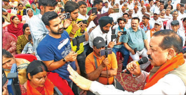
Union Minister Dr. Jitendra Singh addressing a public meeting during election campaign in Kathua on Sunday.

■ STATE TIMES NEWS KATHUA: Union Minister and BJP Candidate for Udhampur Lok Sabha constituency Dr Jitendra Singh said here on Sunday that Kathua developed from a small town to a promising destination after 2014 in the last ten years. Addressing a series of public meetings in different Wards of the city here today, Dr. Jitendra Singh said, those who visited Kathua before 2014 will be taken aback, if they visit now and see the change of face and miraculous transformation cum development.