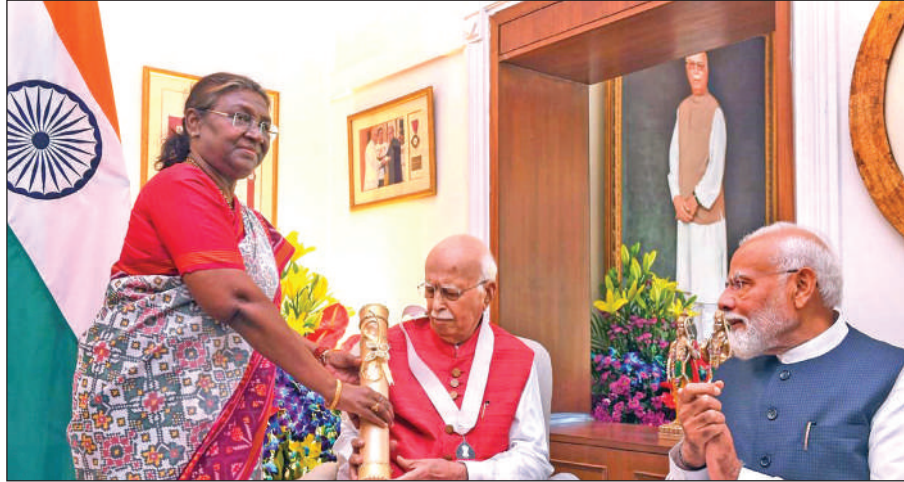
President Droupadi Murmu conferring Bharat Ratna on veteran BJP leader L.K Advani at his residence in New Delhi. Prime Minister Narendra Modi is also seen.

honour is a recognition of his enduring contributions to the nation's progress. "His dedication to public service and his pivotal role in shaping modern India have left an indelible mark on our history. I am proud to have got the opportunity to work with him very closely over the last several decades," the prime minister said. The Rashtrapati Bhavan described Advani as a doyen of Indian politics and said that he has served the nation with unwavering dedication and distinction for over seven decades. As a parliamentarian, his emphasis on dialogue enriched parliamentary traditions, it said. Whether as home minister or as deputy prime minister, Advani always prioritised national interest above all, earning him respect and