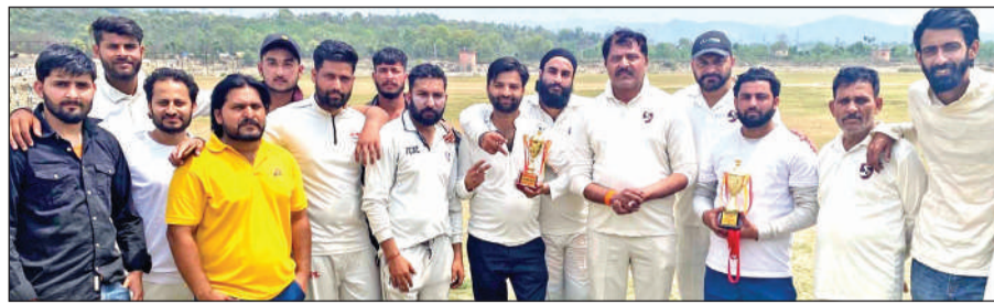
Winner team posing for a photograph at Jammu on Wednesday.