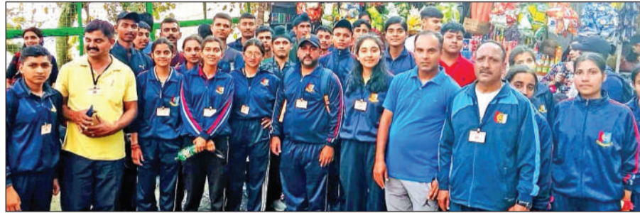
Participants and officials of Trikota trek posing for a photograph.