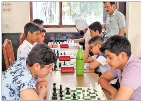
Chess matches in progress at Jammu on Wednesday.