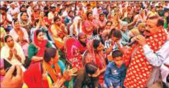
Union Minister Dr. Jitendra Singh addressing public meeting at Budhi on Saturday.

■ STATE TIMES NEWS KATHUA: Union Minister and BJP Candidate for Udhampur-Doda-Kathua Lok Sabha constituency Dr Jitendra Singh alleged here on Saturday that the Congress Party in desperation, is seeking support from anti-national forces in a vain bid to garner votes for the upcoming first phase polling on 19th of this month. Addressing a series of public meetings in the rural and urban suburbs of Kathua including Challan, Sesswan, Bann, Channi, Hamirpur, Bhudhi, Jandore, Barbal, Utteri, Logate, Sahar, Sherkotla, Khatera, Bhed Blode, Mehtabpur, Khokhiyal, Pandore etc, Dr Jitendra said, Congress Party has no issue to raise or work of development to claim