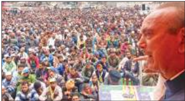
DPAP Chairman Ghulam Nabi Azad addressing public meeting at Bhalessa on Saturday.

■ STATE TIMES NEWS JAMMU: In a seathing attack to those exploiting sentiments of the people,