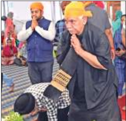
LG Manoj Sinha paying obeisance at Gurudwara Sahib Abtal, Ramgarh Samba.

Sinha pays tributes to General Zorawar Singh JAMMU: Lieutenant Governor Manoj Sinha on Saturday paid tributes to great warrior and military strategist General Zorawar Singh on his Birth Anniversary. The Lt Governor laid wreath at the statue of General Zorawar Singh Ji at a commemorative event organized by J&K Ex-Services League. The Lt Governor said that General Zorawar Singh was a true national hero and remain a source of inspiration for the people across the country.