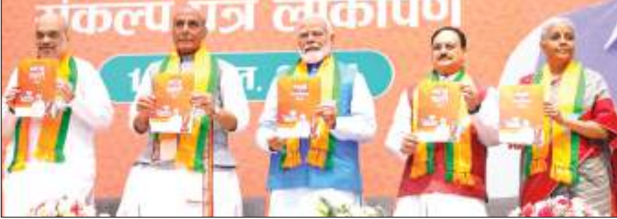
PM Narendra Modi and others releasing BJP's manifesto on Sunday.

■ STATE TIMES NEWS NEW DELHI: Prime Minister Narendra Modi made a pitch for electing a strong and stable government in an uncertain world beset by geopolitical tensions as the BJP on Sunday released its manifesto, prioritising development and welfare while shunning populist measures and contentious issues like the NRC. Named "Modi ki Guarantee", the manifesto largely builds on the government's existing welfare schemes targeted at different sections of society, while reiterating the BJP's commitment to roll out one-nation-one-election and Uniform Civil Code, two issues mentioned in its 2019 manifesto too. The government has taken some concrete steps for their implementation. The BJP promised to include all senior citizens above the age of 70 years in the 'Ayushman Bharat'