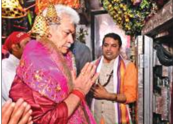
LG Manoj Sinha participating in Pratham Pooja of Shri Mata Vaishno Devi Ji Pracheen Marg Pavitra Chhari Yatra at Kol Kandoli Temple, Nagrota.