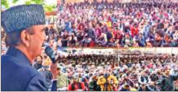
DPAP Chairman Ghulam Nabi Azad addressing public meeting in Kishtwar on Sunday.

■ STATE TIMES NEWS JAMMU: Chairman Democratic Progressive Azad Party (DPAP), Ghulam Nabi Azad on Sunday strongly criticized