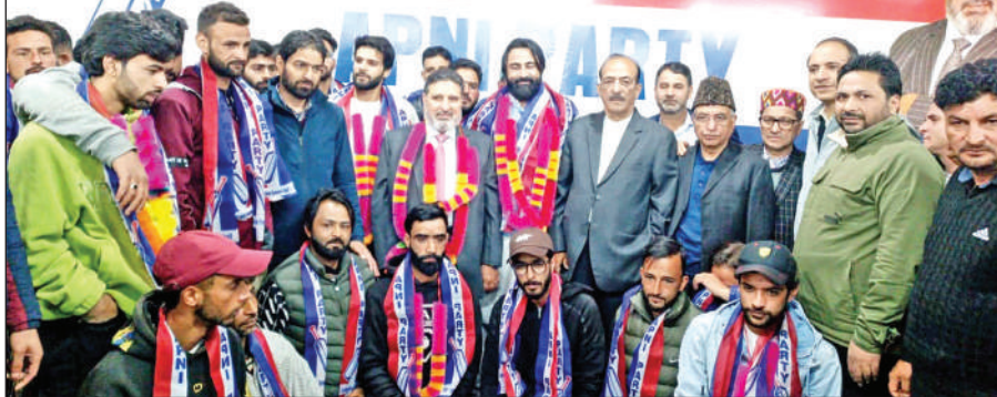
JKAP president, Syed Mohd Altaf Bukhari with newly joined members and other leaders.

Taking a dig at the traditional parties, Syed Mohammad Altaf Bukhari