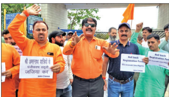
Shiv Sena activists raising slogans during a protest.