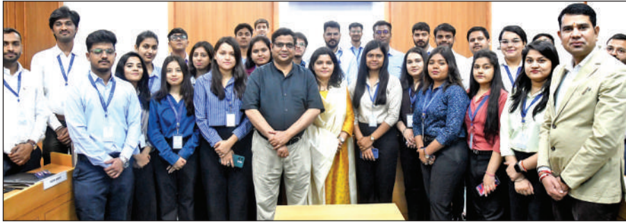
MBA students of the National Institute of Food Technology, Entrepreneurship and Management Sonapat, Haryana with faculty at IIM Jammu.