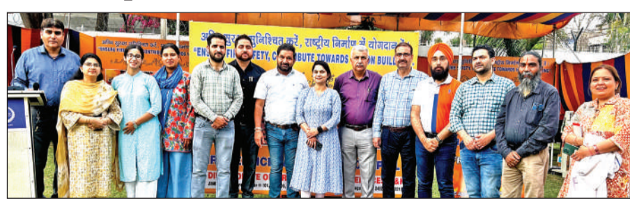
People's Hut Foundation members with doctors at a camp.