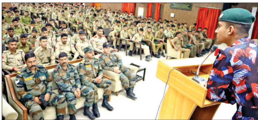
Shaurya Chakra Awardee delivering lecture at NCC Training Academy in Nagrota.