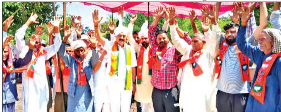
Former Minister Surjeet Singh Slathia during public meeting at Samba.