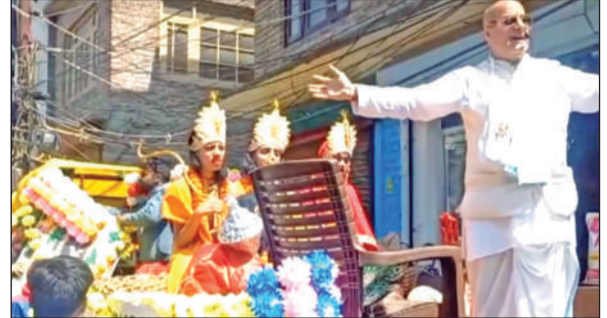
Kashmiri Pandits taking out Shobha Yatra in Srinagar.

Like every year, this year too, the main Shobha Yatra started from the Zaindar Mohalla in the old city and culminated at Tankipora with a large number of