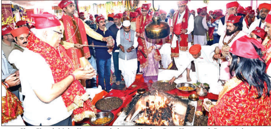
Shat Chandi Maha Yagya concluding at Vaishno Devi Shrine with Puran Ahuti.

More than three lakh devout pilgrims made their journey to the revered Shrine during the auspicious