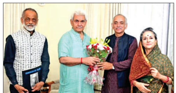
Lt Governor Manoj Sinha meets Gajapati Maharaja Shri Dibyasingha Deb, Chairman, Shree Jagannatha Temple Managing Committee, Puri.