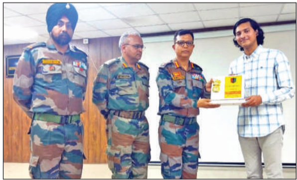
Army officers presenting memento to a resource person.

STATE TIMES NEWS NAGROTA: In a bid to enrich the minds of the next generation, a captivating lecture cum interactive session on Artificial Intelligence (AI) was conducted at NCC Training Academy in Nagrota. The event, orchestrated by two