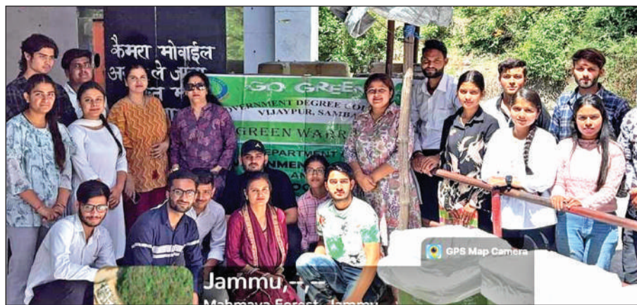
Students and faculty of GDC Vijaypur after cleaning River Tawi.