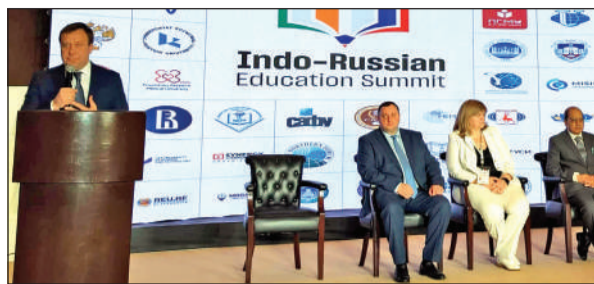
A dignitary speaking at Indo-Russian Education Summit.

The event was graced by the presence of some esteemed presence of luminaries such