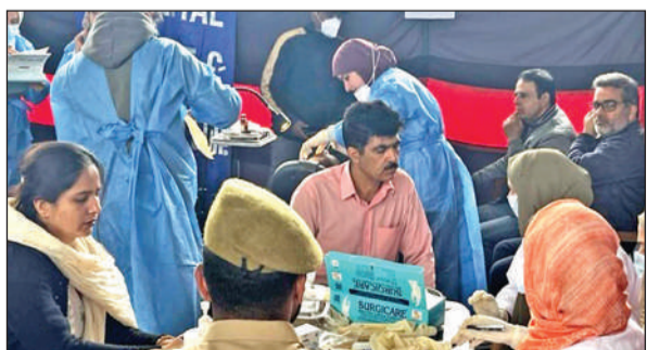
Fire Service employees examining at medical aid camps.

STATE TIMES NEWS JAMMU: As part of ongoing Fire Service Week, various programmes are being conducted by the Fire and Emergency Services department to educate public about different aspects of fire safety.