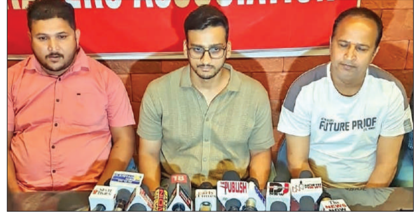
JKLTA representatives addressing a press conference at Jammu on Monday.

The Association regretted that some mischievous elements are trying to build wrong narrative in public that extra charges are being taken by some liquor