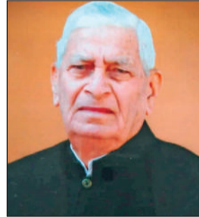
mortal remains will be taken to his native village MairaMandrian, Akhnoor

His cremation will take place at ChandianGhaatAkhnoor on Tuesday at 3.00 pm. His