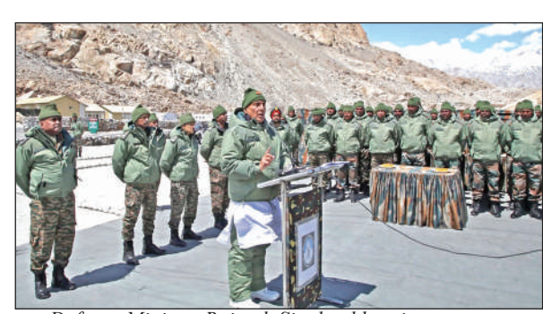
Defence Minister Rajnath Singh addressing troops at Siachen on Monday