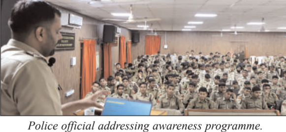
Police official addressing awareness programme.

STATE TIMES NEWS JAMMU: Cyber awareness programme organised by Cyber Police Station Jammu and 2 J&K BN NCC H No 41, Sec-1 Nanak Nagar Jammu. The programme was attended by the officials and around 400 cadets of the academy. During the awareness programme, the participants were enlightened about the emerging cyber crime particularly bank frauds including bank/SIM, KYC fraud, part time job fraud, investment scams, courier delivery fraud, and social media related