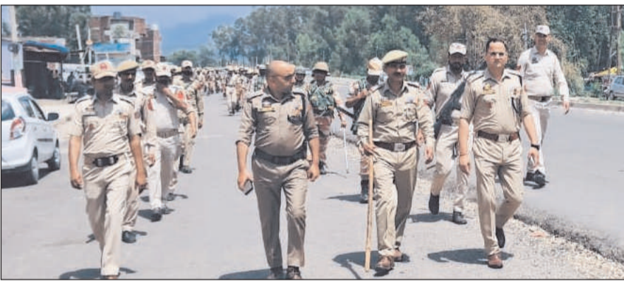
Police officials conducting route march in Jammu on Monday.

STATE TIMES NEWS JAMMU: Various route marches are conducted in Rural zone of Jammu District under the close supervision of SSP Jammu and SP Rural Jammu in the JDs of PS Khour, PP Jourian, PS Akhnoor, PS Gharota, PP Pargwal, PS Kanachak, PS Domana, PP Chinore, PP Pouni Chak, BPP Sandwan, PS Nagrota, PS Jhajar Kotli, PP Sidhra and PP Manwal. All the territorial officers including SDPOs, SHOs and ICPPs/ICBPPs were participated in the march along with Armed and CAPF officers/officials. Route marches are part of standard security measures to ensure safety and order during elections. These marches help in familiarizing security personnel with the area and enhancing their readiness to handle any potential security threats during the electoral process. Besides helps them in intelligence gathering. Visible presence of security