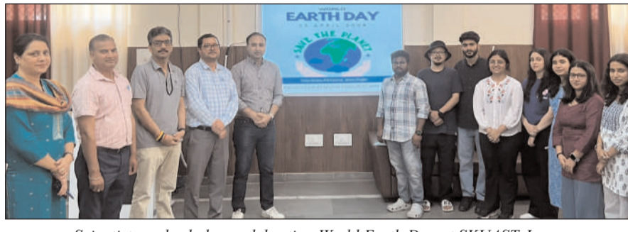
Scientists and scholars celebrating World Earth Day at SKUAST Jammu.