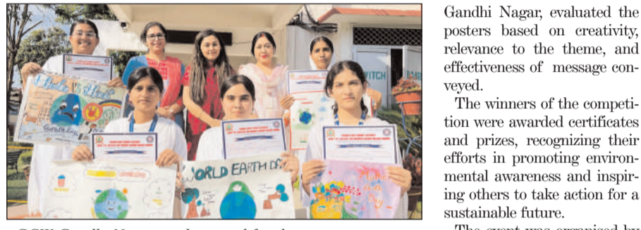
GCW Gandhi Nagar students and faculty at a programme.

STATE TIMES NEWS JAMMU: In commemoration of World Earth Day, NSS Unit 1 of Government College for Women (GCW), Gandhi Nagar, in collaboration with the Department of Botany, Cluster University of Jammu, on Monday organised a poster making competition aimed at raising awareness about environmental conservation and sustainable living to mark World Earth Day celebrations. The event, held on the College Campus, witnessed enthusiastic participation from NSS volunteers. Participants showcased their artistic talents while conveying powerful messages about the importance of protecting our planet and adopting eco-friendly practices. The theme of this year's Earth Day, "Planet Vs Plastic", resonated