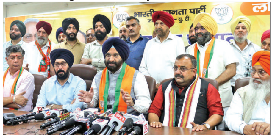
BJP National Secretary Manjinder Singh Sirsa addressing a press conference.