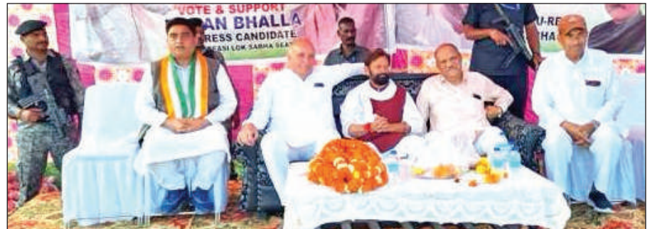
Senior Congress leaders addressing a public meeting.