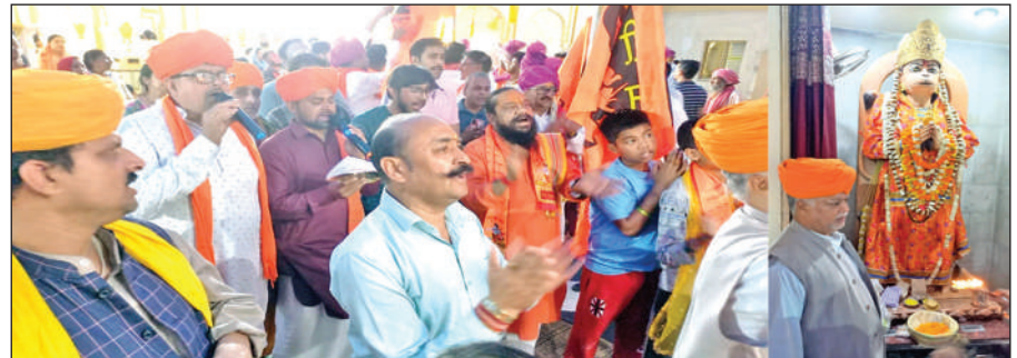
J&K Dharmarth Trust members and others performing Puja of Lord Hanuman.