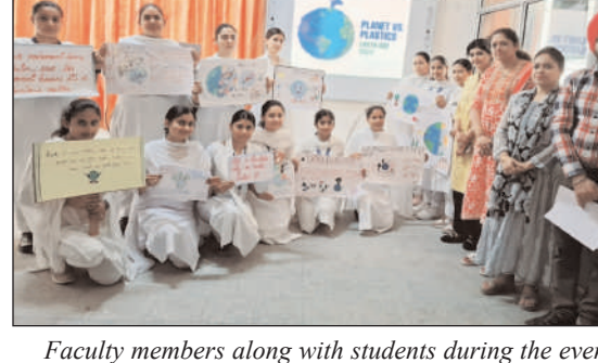
Faculty members along with students during the event.