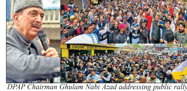
in Qazigund on Wednesday.

Azad emphasized party's commitment to fielding young, fresh candidates, who embody honesty and