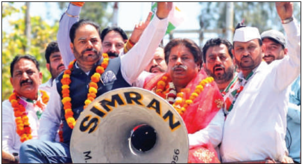
Senior Congress leaders during election rally at Jammu.

The impressive rally passed through RS Pura Jammu South Constituency, Jammu East Constituency, Jammu West Constituency starting from Satwari Chowk, Jewel Chowk via Fortune Inn Riviera, Vivekanand Chowk, Gummat Bazar, Indira Chowk, MLA Hostel to GMC Chowk, Shakuntala Chowk, Rehari Chungi, New Plot Children Hospital, Amphalla Chowk, CPO Chowk, Kachi Chawni, Parade Ground,