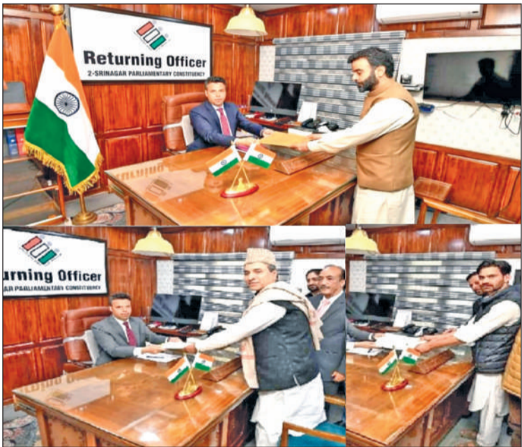
RO 02-Srinagar Parliamentary Constituency.