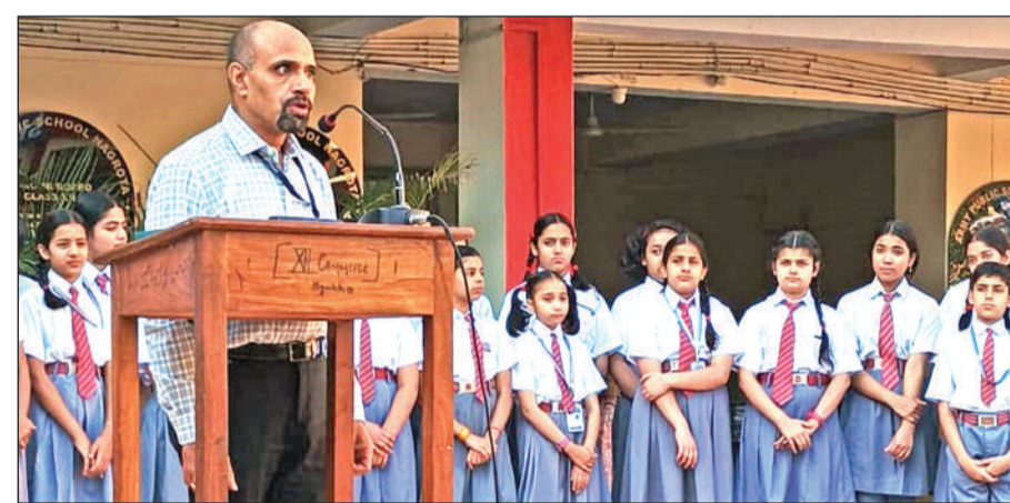
A dignitary speaking during a programme at Jammu on Thursday.

The IEC activities included publishing of IEC material