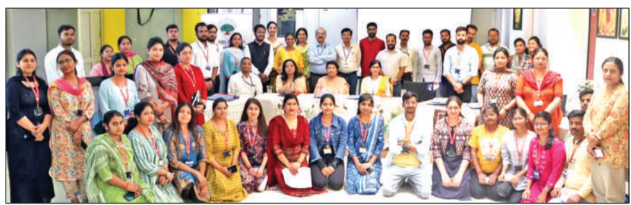
CUJ students and faculty during a Thursday Mind Meet.

JAMMU: The Department of Educational Studies at the Central University of Jammu (CUJ) organized a panel discussion titled "Transforming the Role of Teachers and Teacher Educators in Light of NEP-2020" as part of the "Thursday Mind Meet" initiative.