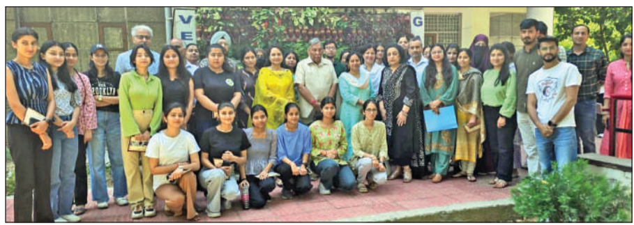
Students and faculty of JU and INTACH officials at a programme on Thursday.

JAMMU: The Department of Environmental Sciences, University of Jammu and Indian National Trust for Art & Cultural Heritage (INTACH) Jammu Chapter on Thursday jointly organized a presentation cum interactive session on 'Traditional Water Bodies of Jammu Municipal Corporation Area'.