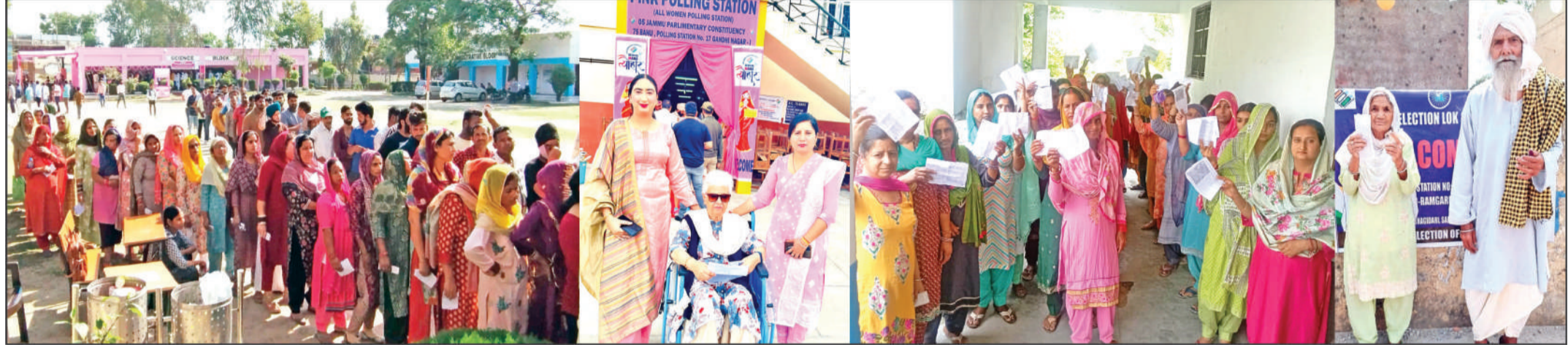
Glimpses of polling at various polling stations for Jammu Parliament constituency in second Phase of Lok Sabha elections.

Chief Electoral Officer congratulated all the first time voters and expressed gratitude towards all the voters for their enthusiastic participation in the polling for the second phase of General Elections. He also complimented the polling personnel engaged in the election process for successful conduct of the second phase of elections in Jammu and Kashmir.