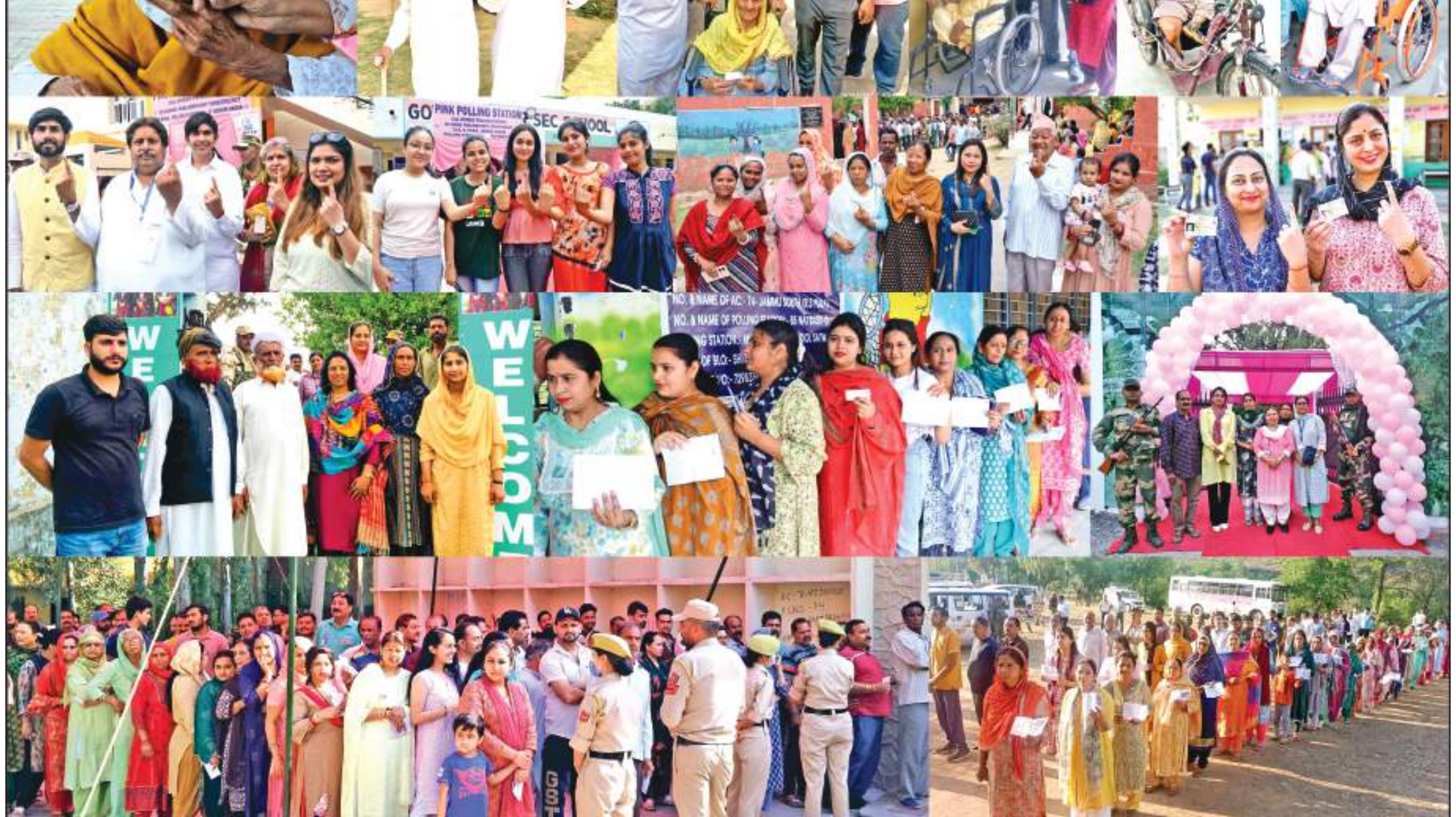
A large number of people including women, senior citizens and first time voters casting their votes at Jammu Parliamentary Seat on various polling booths in Jammu on Friday.