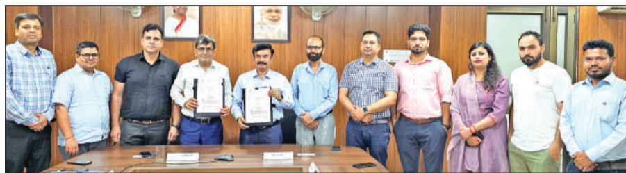
CSIR-IIIM and NDTL representatives after signing MoU on Saturday.