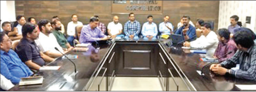
JMC and ULBs staff at one day training cum interactive session.