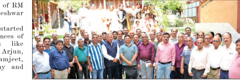
Members of Khatri & Arora Consortium at a meeting.