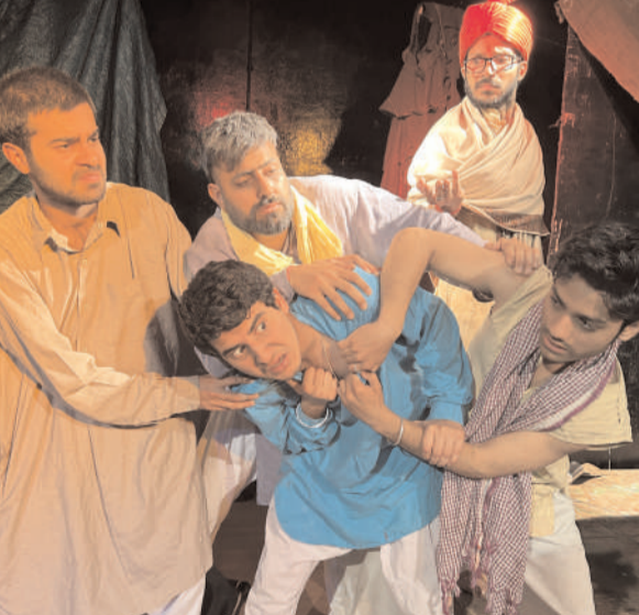
Natrang artists performing in a play.