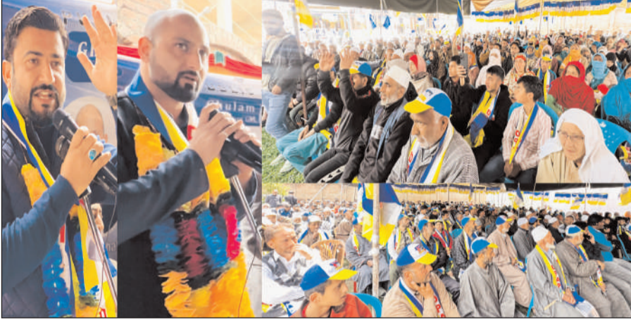
DPAP leaders addressing public meeting at Srinagar.