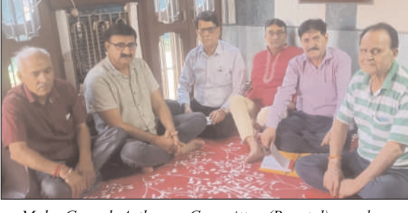
Maha Ganesh Asthapan Committee (Brantal) members at a meeting.

STATE TIMES NEWS JAMMU: Maha Ganesh Asthapan Committee (Brantal), Sirru, Pattan, Baramulla held a meeting at Bohri, Jammu today to review the arrangements for Maha Yagya to be solemnised on May 21-22 (Ganesh Chaturthi) at Durga Mandir Durga Nagar, here. The members took stock of the contributions received and yet to be received from Sirru Biradari families and decided to convene a general meeting of the Brantal Biradari on May 7, 2024, to finalise all the arrangements and assign specific duties to the concerned members in order to per-