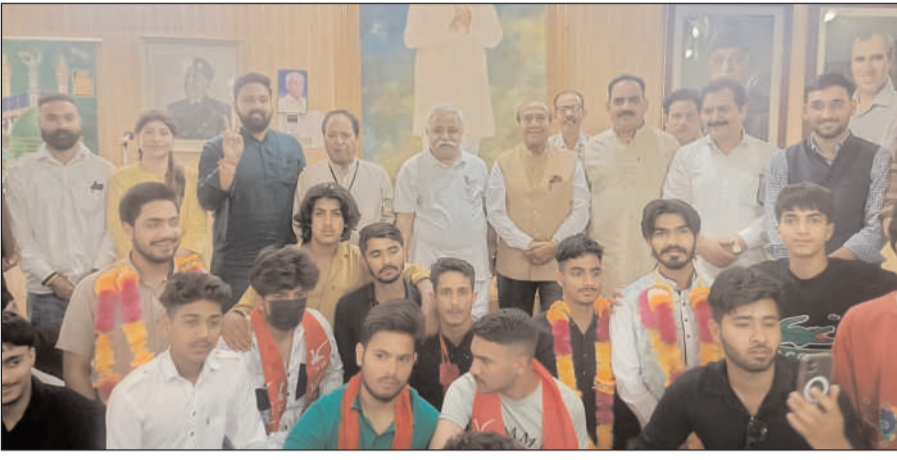
JKNC leaders and youth wing members at a meeting.