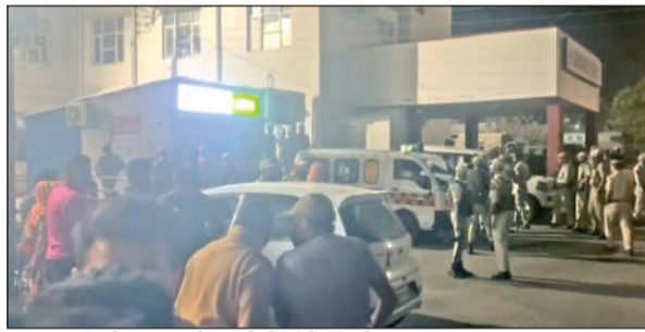
Police cordoned off GMC Kathua campus to trace out slain gangster's accomplices.