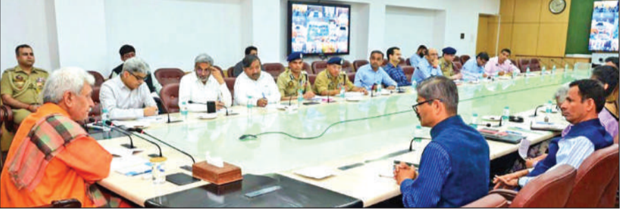
LG Manoj Sinha chairing high level meeting in Jammu on Tuesday to review preparedness for upcoming festivals.