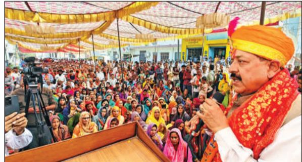
Union Minister Dr. Jitendra Singh addressing public rally at Gordy of district Udhampur on Tuesday.

Dr Jitendra accused the Congress led governments in the past, including the UPA government from 2004 to