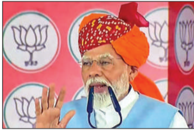
BJP-led government will be about taking "historic decisions".

"This election is to uproot corruption, to fulfil the dream of self-reliant India, to resolve for the prosperity of the farmers and to provide tap water to every household...but the Congress and its INDI Alliance are fighting the elections not for the country but for their own selfish motives," Modi said.