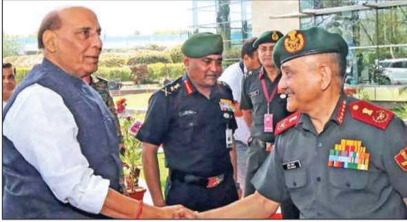
Defence Minister Rajnath Singh being welcomed by Chief of Defence Staff General Anil Chauhan as he arrives to attend the Army Commanders' Conference, at the Manekshaw Auditorium, in New Delhi on Tuesday. Army Chief General Manoj Pande is also present.

The defence minister, complimenting the Army leadership for successfully taking ahead the country's defence