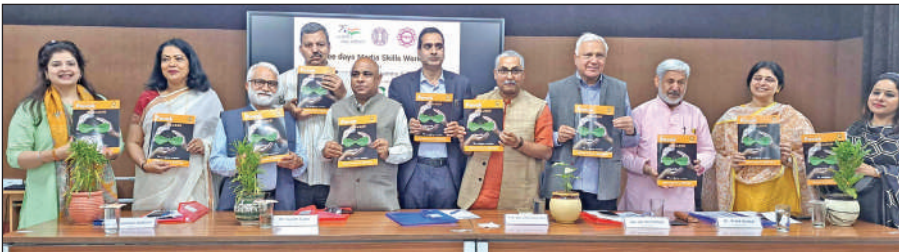
Dignitaries during the workshop at IIMC.