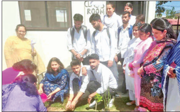
GDC Bishnah students and faculty planting a saplings.