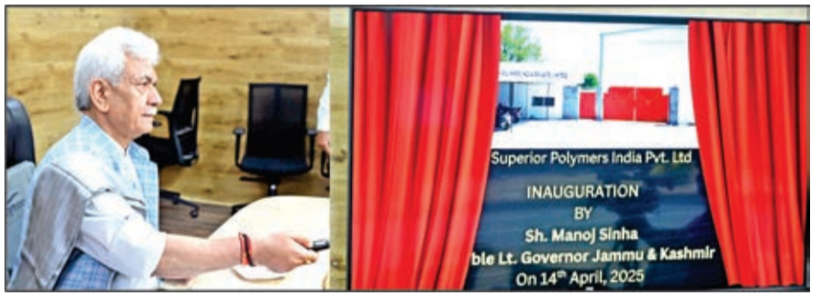
LG Manoj Sinha virtually inaugurating Superior Polymers India Pvt Ltd's manufacturing unit at Kathua on Monday.

STATE TIMES NEWS JAMMU: Lieutenant Governor Manoj Sinha on Monday virtually inaugurated the Manufacturing Unit of Superior Polymer India Private Limited at Kathua. The Lieutenant Governor congratulated the Superior Group of Industries and the members of Superior Polymer India Private Limited on their new venture and conveyed his best wishes. He said the commencement of this greenfield project is an important milestone, promising a positive impact on the local economy and employment generation, and a significant push to the industrial development of the region. "UT's manufacturing ecosystem is growing and today's project dedicated to the industrial development will give momentum to the mission of Aatmanirbhar J&K," the Lieutenant Governor said. The Lieutenant Governor reiterated that, under the guidance of Prime Minister Narendra Modi and Home Minister Amit Shah, we are committed to the advancement of the industrial sector in Jammu and Kashmir.