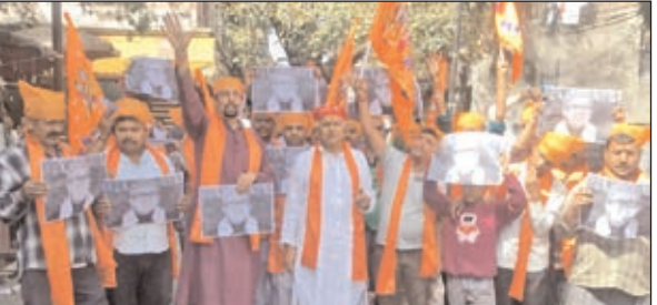
DFSS activists staging protest in Jammu on Tuesday.