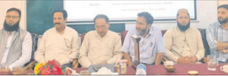
A section of dignitaries during the programme.