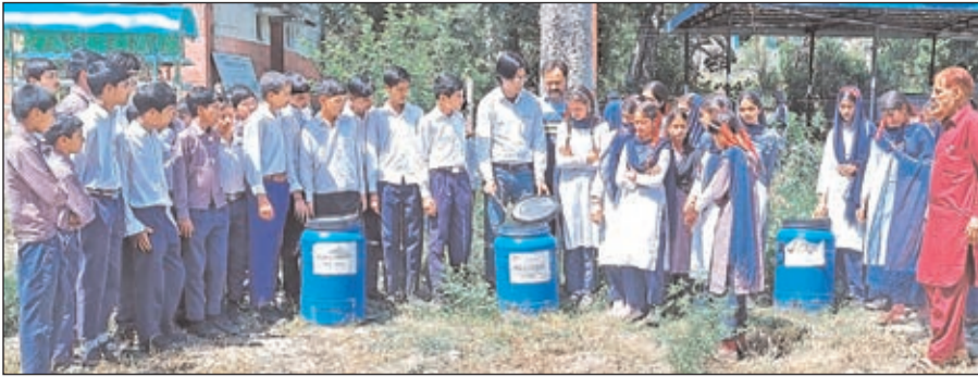
KVK scientist explaining students.

Chief Scientist and Head of KVK, Reasi, Dr.