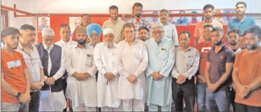
JKNC members paying tributes to Pahalgam victims at Udhampur.

The participants observed a two-minute silence in memory of the victims, followed by prayers for peace and strength for the affected families.