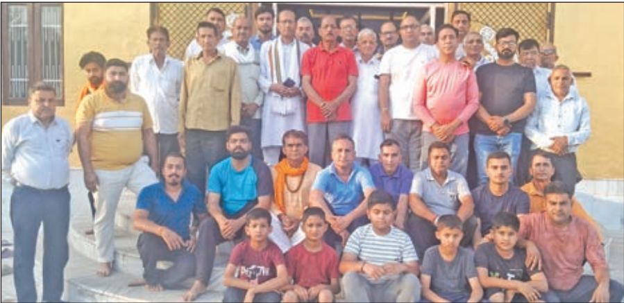
Members of Bhagwan Shree Parshuram Dham Mandir Management Committee Gurah Mundian after the meeting.

■ STATE TIMES NEWS HIRANAGAR: Showing complete solidarity with families of innocent victims of Pahalgalam terrorist attack, a meeting of Bhagwan Shree Parshuram