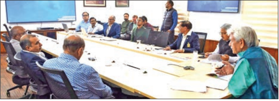
LG Manoj Sinha chairing meeting with senior officials of SASB at Srinagar.

■ STATE TIMES NEWS SRINAGAR: Lieutenant Governor Manoj Sinha on Wednesday chaired a meeting with the senior officials of Shri Amarnath ji Shrine Board (SASB) and executing agencies and reviewed the progress for development of Disaster Management and Yatri Niwas Complexes.