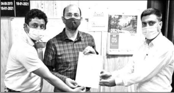
Officials releasing financial assistance for workers.