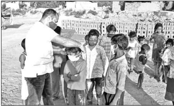
NSS volunteers of college distributing masks among children.

JINDRAH: The NSS unit of Government Degree College (GDC) Jindrah under its Azaadi ka Amrit Mahotsav conducted sanitization drive and distributed face masks at public places in and around Jindrah village with the help of NSS volunteers of GDC Jindrah and locals. An intense sanitization drive was conducted at all the public places of village Jindrah and locals. Awareness regarding this deadly disease was spread to break the chain of Covid-19. The masks were also distributed and importance of timely and early testing of covid was also recommended to save the precious lives of people. People were also made aware of social distancing, importance of frequent hand washing and proper