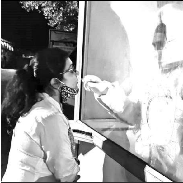
COVID sampling in progress at Poonch.

Administration has also ensured the assured supply of the essentials in the district to mitigate the sufferings of the common masses amid the pandemic.