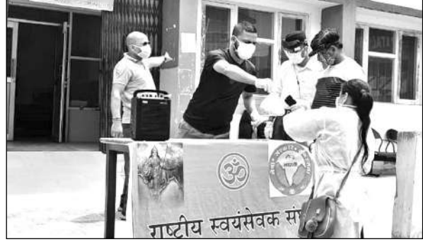
RSS volunteers distributing ration among attendants.