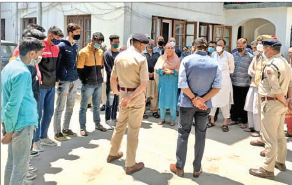
Police handing-over boys to family members.

■ STATE TIMES NEWS SRINAGAR: Police on Sunday handed over seventeen boys to their parents after proper counselling in Central Kashmir's Srinagar district.