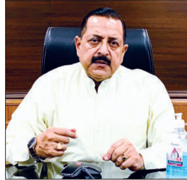
Union Minister Dr Jitendra Singh convening a high level On-line meeting of the officials of Department of Personnel & Training (DoPT), on Tuesday.

STATE TIMES NEWS NEW DELHI: Union Minister of State (Independent Charge) Development of North Eastern Region (DoNER), MoS PMO, Personnel, Public Grievances, Pensions, Atomic Energy and Space, Dr Jitendra Singh on Tuesday appealed to all the eligible employees of the age of 18 years and above to get themselves vaccinated at the earliest. A circular in this regard was already issued by the DoPT on April 22, 2021. Earlier, in compliance with the OM of even number dated April 6, 2021, the Minister had appealed to all the eligible employees of the age of 45 years and above to get themselves vaccinated. He also expressed satisfaction that the DoPT has organized regular camps for vaccination at North Block and all officers above 18 are taking benefits of the same after registering on www.cowin.gov.in.