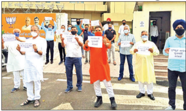
BJP leaders staging protest against TMC at Jammu.