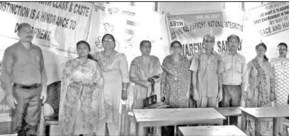
Organisers along with faculty and dignitaries during the event.