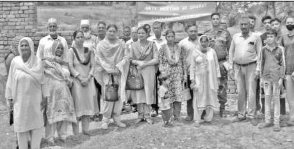
Army officials along with locals during the programme.