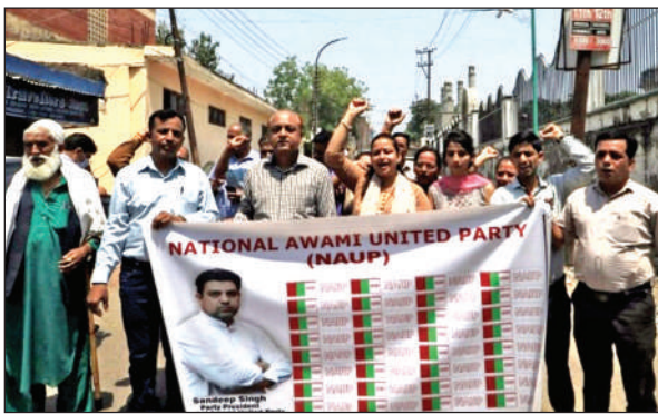
NAUP leaders and members raising slogans during a protest.