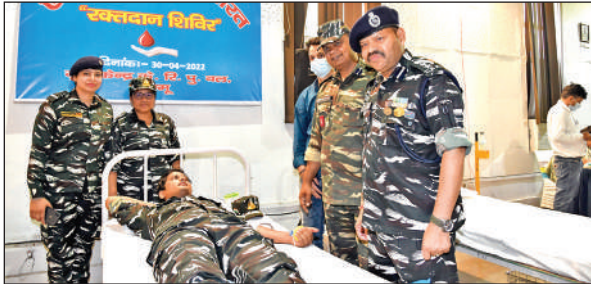
CRPF personnel donating blood during a camp.