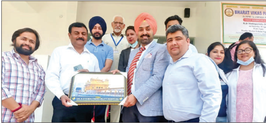
Dignitaries presenting a memento to the Chief Guest.