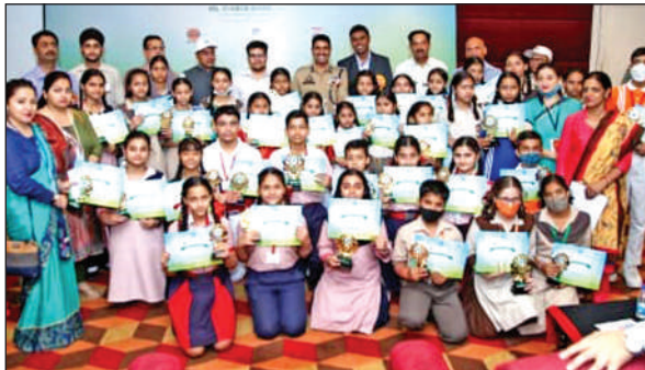
Winner students posing with dignitaries.

He appreciated the efforts of Oil Marketing Companies (IOCL/ HPCL & BPCL) operating in J&K for creating mass awareness about conservation of petroleum products. IGP also encouraged the young minds to take initiative and inculcate new ideas to promoting the