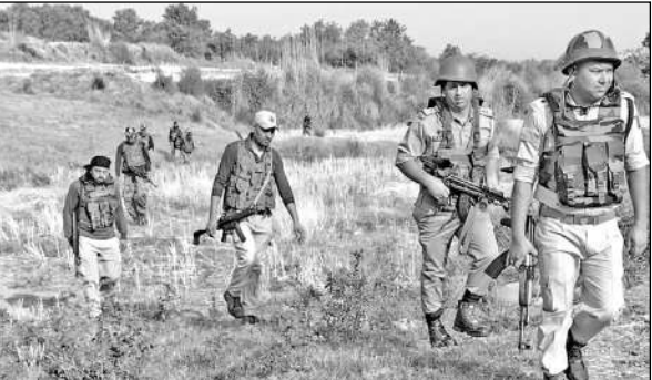
Security personnel carrying out search operation.

■ STATE TIMES NEWS SAMBA: The search operation has been launched by Police, Special Operation Group (SOG) and Central Reserve Police Force(CRPF) along IB in view of annual Amarnath Yatra from June