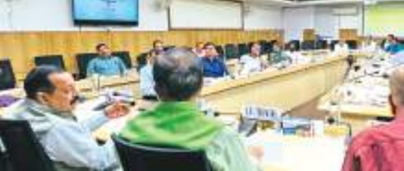
Union Minister Dr Jitendra Singh addressing the Orientation Programme on Urban Governance for Mayors/Chairpersons and Municipal Commissioners/Chief Executives Officers from Urban Local Bodies from Jammu & Kashmir, at IIPA New Delhi .