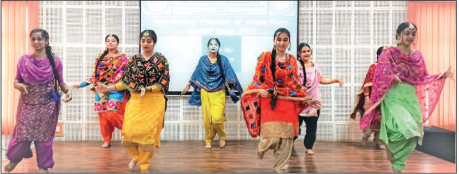
Students presenting dance during closing ceremony of NSS special camp.