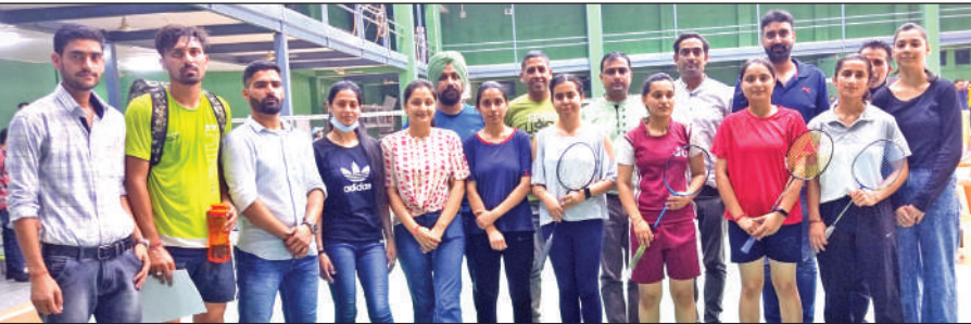
Winner students posing with faculty members.