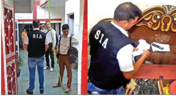
SIA teams carrying out raids in Jammu on Friday.