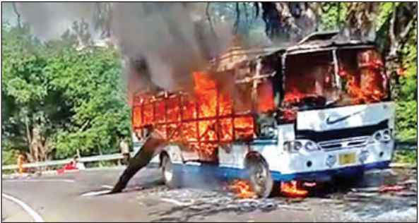
A Jammu-bound bus under fire at Katra on Friday.

The Additional Director General (ADG) of Police,