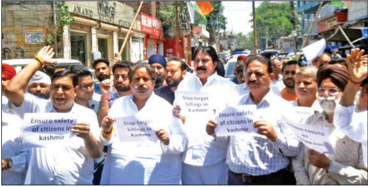
Congress leaders taking out a protest rally at Jammu.

The protestors demanded adequate step to ensure the sense of security and protection of minorities and others including outsiders working there and innocent becoming target of selective killings of terrorists.