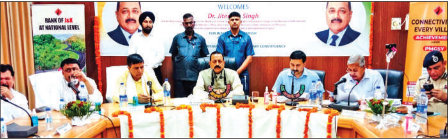
Union Minister Dr Jitendra Singh reviewing the completed roads and bridges projects of his Lok Sabha constituency under Pradhan Mantri Gram Sadak Yojana (PMGSY), at Kathua on Saturday.