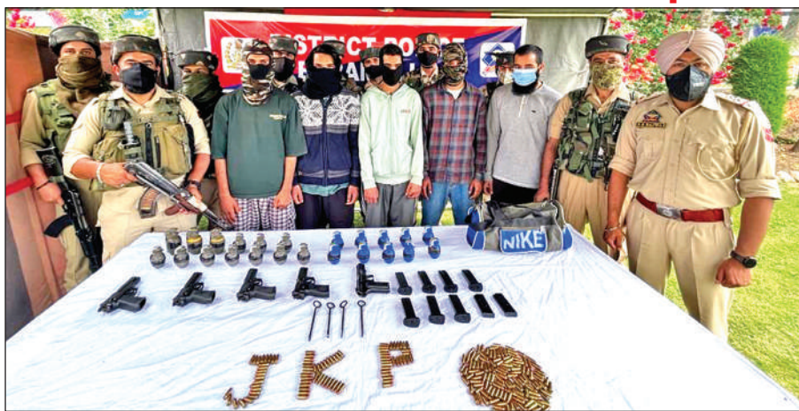
4 terrorists & one associate behind Baramulla grenade attack in police custody along with seized arms & ammunition.

■ STATE TIMES NEWS SRINAGAR: The Jammu and Kashmir Police on Thursday claimed to have solved the Baramulla grenade attack case on a liquor shop within 48 hours of the incident by arresting four Lashkar-e-Taiba terrorists and a terror associate.