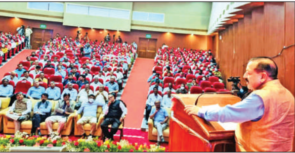
Union Minister Dr Jitendra Singh, addressing Platinum Jubilee celebrations of CSIR-Central Leather Research Institute, at Chennai on Thursday.

Referring to Prime Minister Narendra Modi's pitch for new innovations and next-generation technologies, Dr Jitendra Singh said, the sustainability of the leather sector is likely to emerge as the new challenge