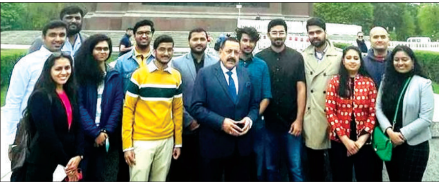
Union Minister Dr Jitendra Singh interacting with Indian StartUps, students and professionals, at Berlin on Sunday.

■ STATE TIMES NEWS BERLIN: Soon after his arrival here on Sunday, Union Minister, Dr Jitendra Singh, who is part of the Prime Minister's official delegation, met Indian StartUps students and young professionals and held nearly a two hour long interaction with them. The Minister appealed to them to avail of various fellowships, joint training programmes and professional options initiated by the government headed by Prime Minister Narendra Modi. He told the Indian students, some of whom are doing Post Doc, doctoral and Master degrees, to avail of wonderful new opportunities back home to do cutting-edge research in Science, Technology and Innovation. Dr Jitendra mentioned that those students doing Post Doc assignment here, and would like to return can apply for Ramanuja Fellowships by Department of Science and Technology for researchers in all areas