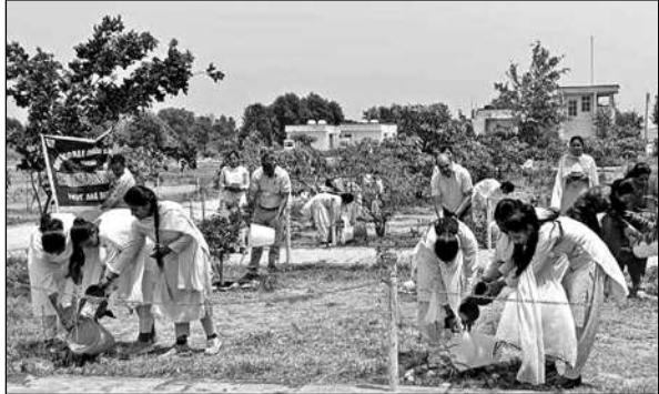
Students watering the plants in college premises.