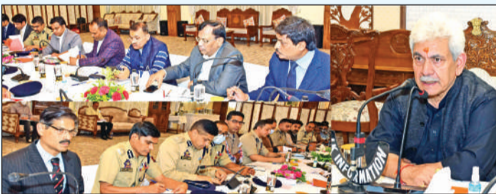
LG Manoj Sinha reviewing arrangements for forthcoming Shri Amarnathji Yatra.

Reviewing the preparations for the Yatra at a high-level meeting in Raj Bhawan, Sinha said that it is the priority of the administration to ensure best facilities for the pilgrims. The meeting was attended by DCs, SSPs and officials of Shri Amarnathji Shrine Board (SASB). The Lt Governor directed that adequate field staff of