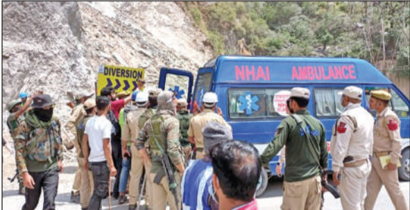
Bodies being shifted to morgue in ambulances from incident site on Saturday.

But on Saturday, the deputy commissioner of Ramban Mussarat Islam quoted the National