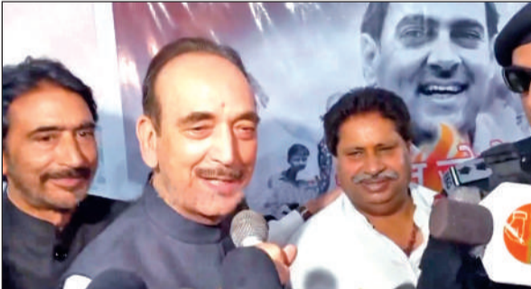
Veteran Congress leader Ghulam Nabi Azad interacting with media in Jammu on Saturday.

Azad, the J&K former chief minister, called for united efforts to finish militancy