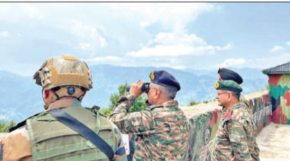
Army Chief General Manoj Pande during visit to a forward area along LoC.

The Army chief, accompanied by Lieutenant General Upendra Dwivedi, Northern Army Commander, and