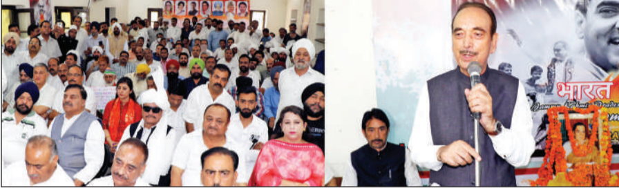
Former Chief Minister and senior Congress leader Ghulam Nabi Azad speaking at a programme.