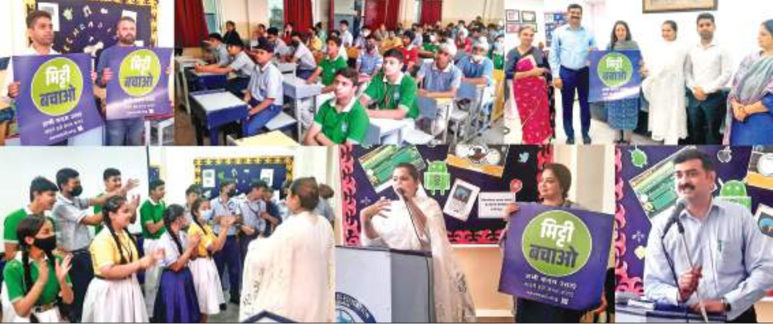
Glimpses of ‘Save Soil’ activities being organized at JKPS Kunjwani.

■ STATE TIMES NEWS JAMMU: Volunteers from Isha Foundation visited the beautify campus of JK Public School (JKPS) Kunjwani and briefed students regarding their project 'Save Soil'. They threw light on the global movement, spear-headed by responsive organizations across the globe to save soil.