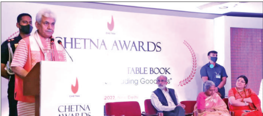
LG Manoj Sinha speaking at Chetna Award ceremony at New Delhi on Sunday.