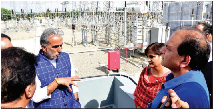
Union MoS Power, Krishan Pal Gurjar during visit to Power Grid Station, SIDCO, Samba.

MoS, while highlighting central government's initiatives of taking J&K development profile to new highs, said that focus is being accorded on regular assessment and review of development works while ensuring benefit of centrally sponsored schemes to all. In this regard,