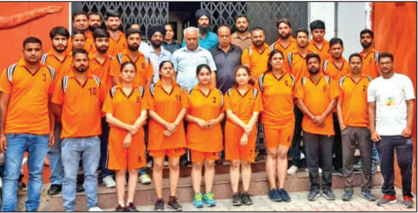
Tug of war teams posing with dignitaries.